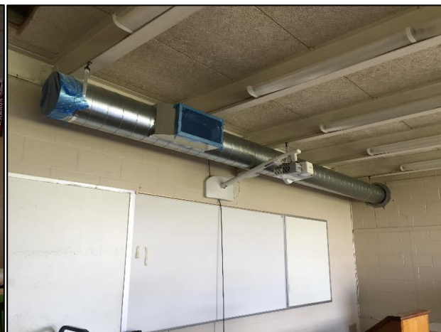
Installation of ductwork in OHS East classrooms is nearly complete