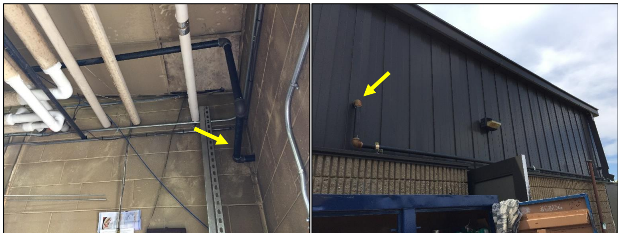
Pipe from boiler through exterior wall to corner of building - TGS