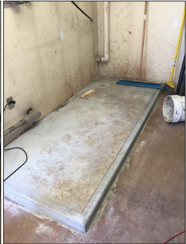
New extended slabs and water tank - South School boiler room