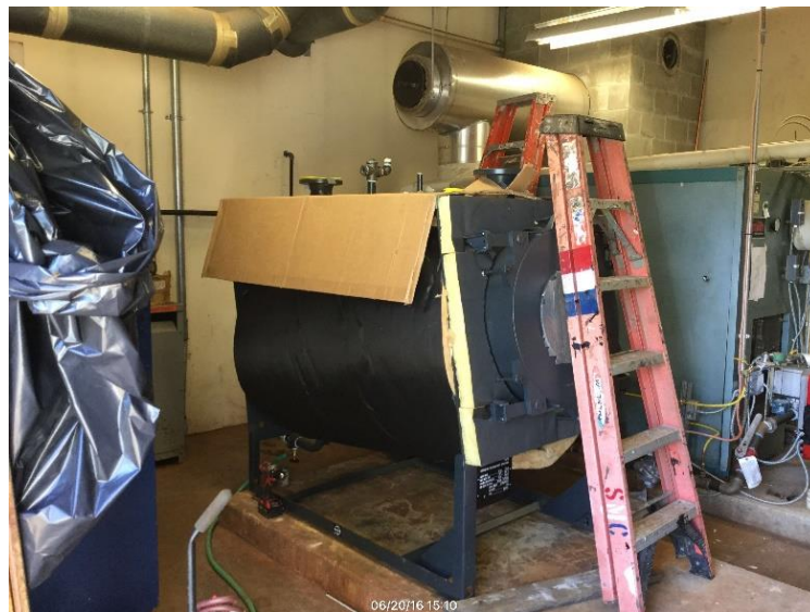
New boiler in place at RDMS