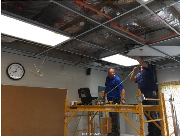
Air barrier installation at OHS West