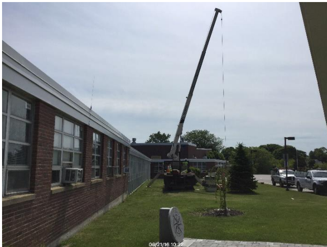
Ventilation equipment being placed at OHS East