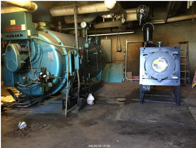
New boiler in place at OHS East